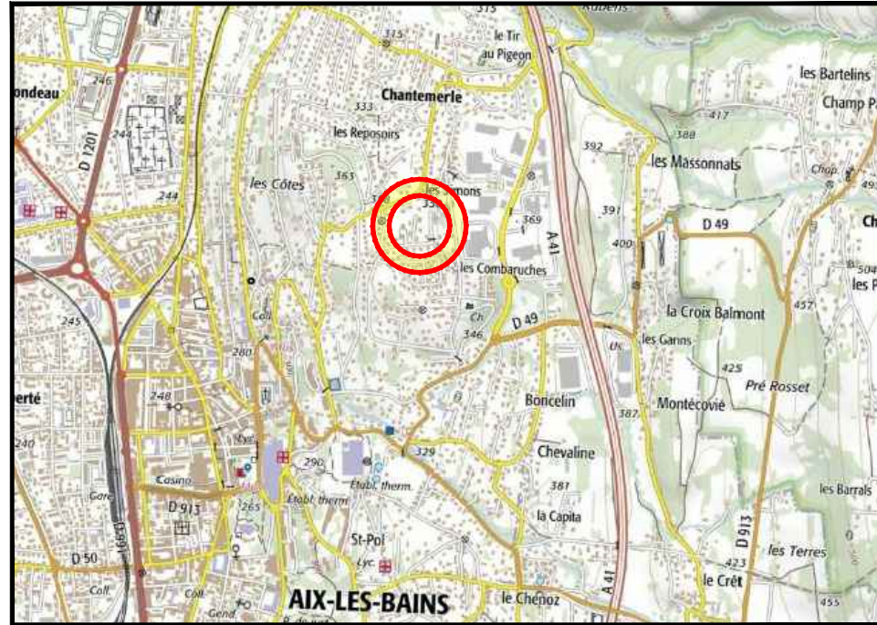
SITUATION DANS LA COMMUNE (1/25000)